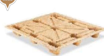
Pressed Wood 48x40 Pallet