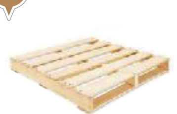
New Wood 36x36 Pallet