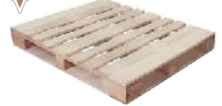
New Wood 48x40 Block Pallet