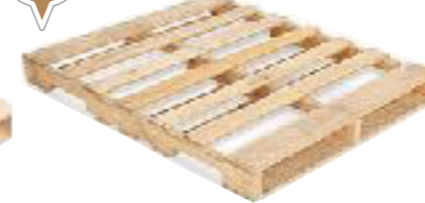
Recycled Wood 48x40 Grade A Standard GMA Pallet