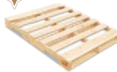
New Wood 48x40 Standard GMA Pallet