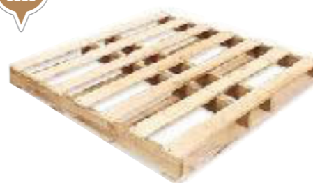
New Wood 48x40 Pallet